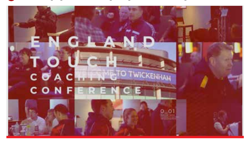
WATCH > Highlights from our inaugral England Touch Coaching Conference

We have also delivered a range of digital CPD workshops to upskill the full range of coaches, players and referees on topics that are not ordinarily covered in formal qualifications. We have had over 20 presenters deliver across the 11 workshops and over 350 participants in the workshops. 2020 will continue to see growth in this area as we continue our commitment to CPD and digital learning.