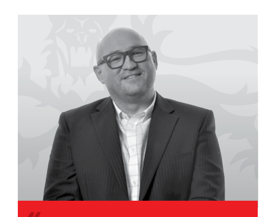
2019 was another good year for England Touch. From growth at grass roots to World Cup success in Malaysia, we have continued to make big strides forward, both on and off the field of play

A huge thank you to everyone involved in our sport – players, coaches, officials, supporters, volunteers, administrators, sponsors and all others who make the England Touch community what it is today. It is a significant honour and privilege to serve the sport from which I get a lot of enjoyment and satisfaction.